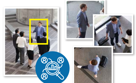
Quick Search via AI Event